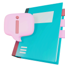
Essentials Trustee Guide

Please see below link for the full document. You will also receive a copy as part of your induction.